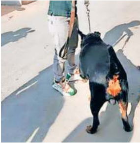
Registration of pet dogs was mandated after a Rottweiler mauled a 4-month-old to death on May 12.

The attack reported in Radheya Residency, a residential society in Ahmedabad's Hathijan, had also left the child's aunt injured.